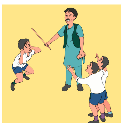
Hitting and ridiculing a child at school