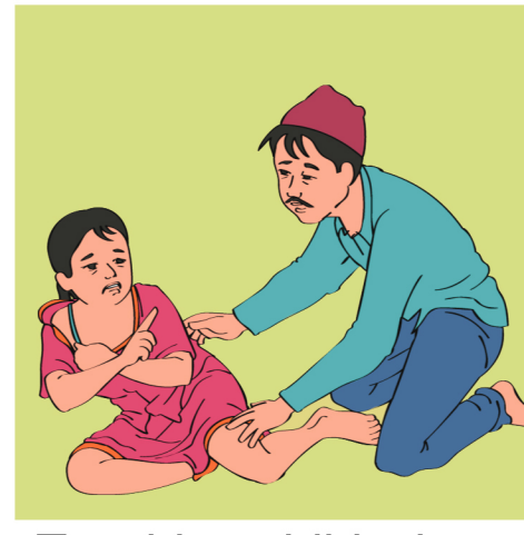
Touching child where the child doesn't want to be touched