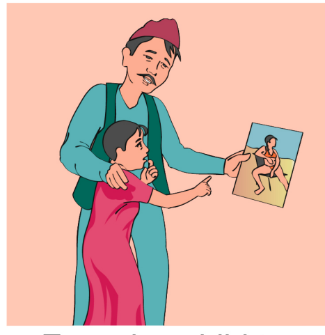
Exposing child to pornographic material or act