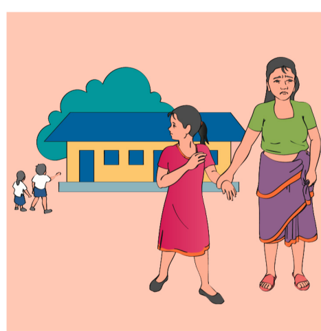
Neglecting educational needs of child