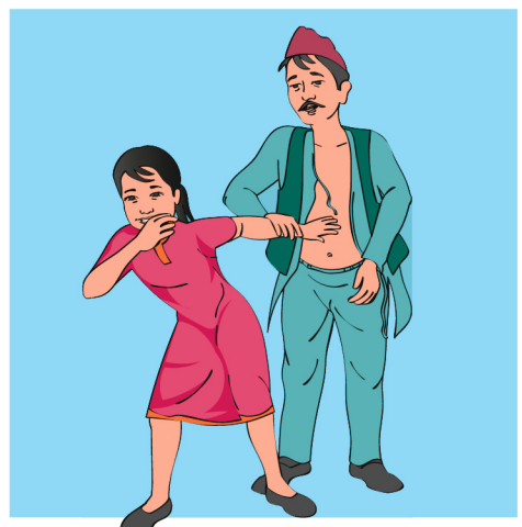
Forcing child to touch the various parts of the body