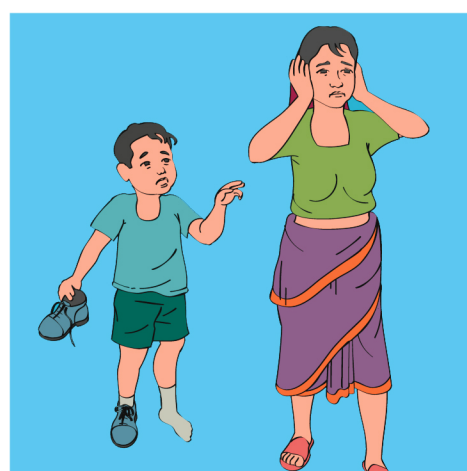
Not listening to Child