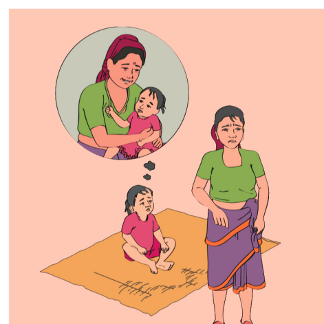
Neglecting emotional needs of child