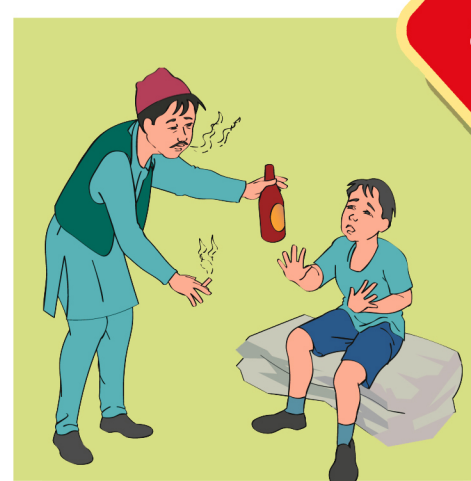
Engaging child in addiction and gambling