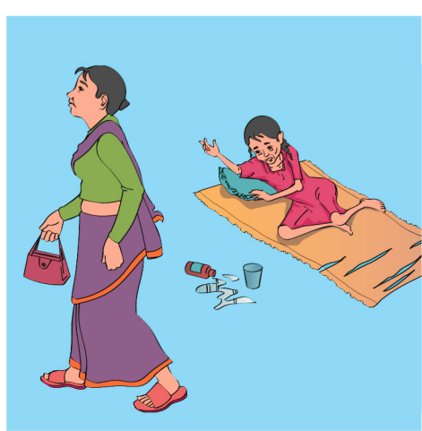
Neglecting medical needs of child