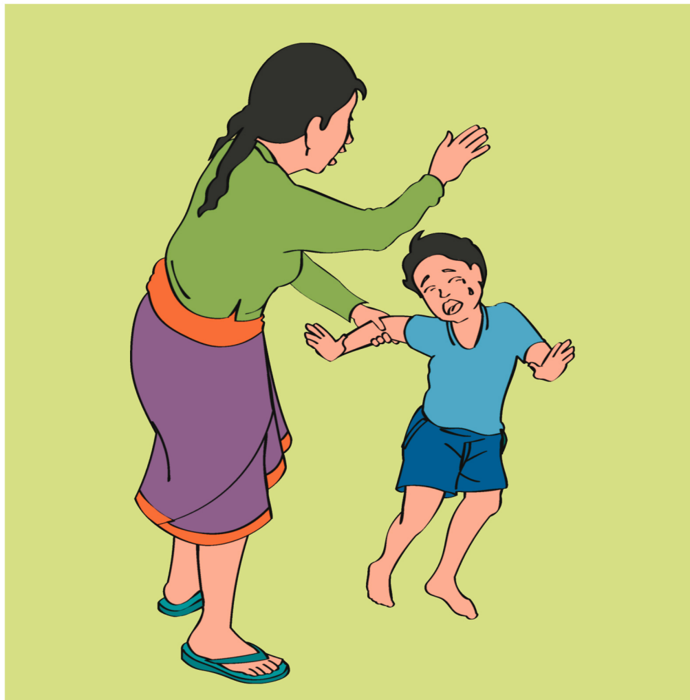
Hurting or hitting a child often to relieve one's own frustration