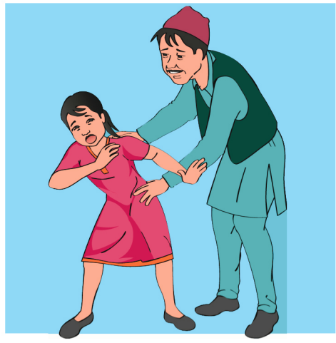
Unnecessarily teasing a child