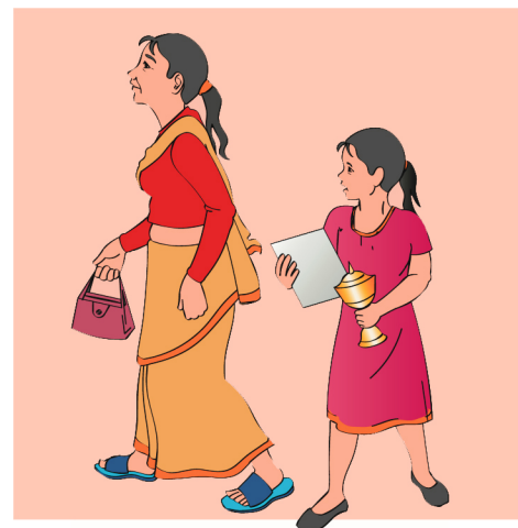
Breaking down the self- confidence of a child