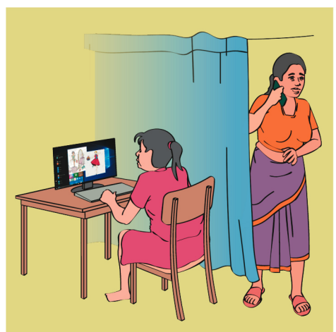
Leaving child online without supervision