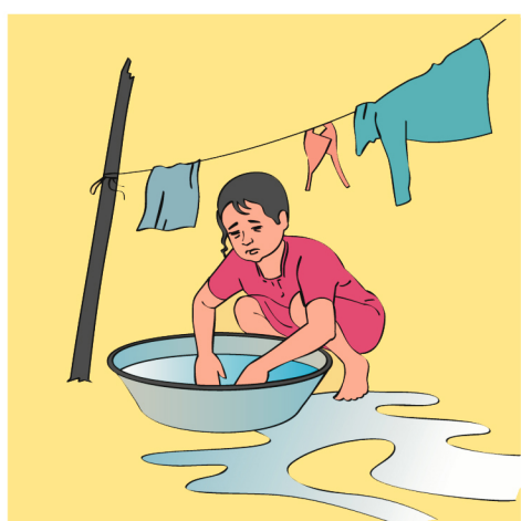
Using child as labour