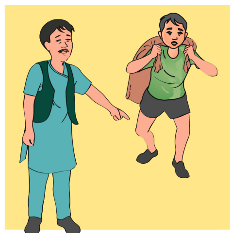
Enticing the child to fulfill one's own selfishness