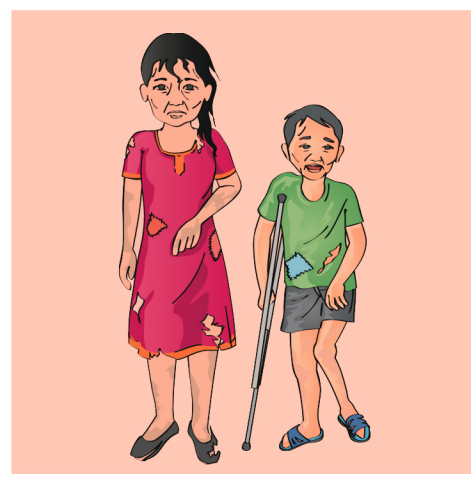
Not caring for child's cleanliness and safe food