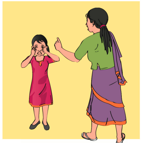
Scolding child with abusive words